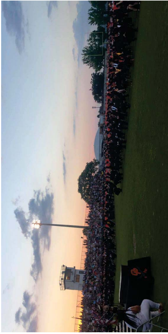
Orange Park High