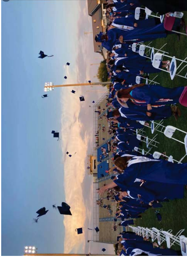
Keystone Heights High