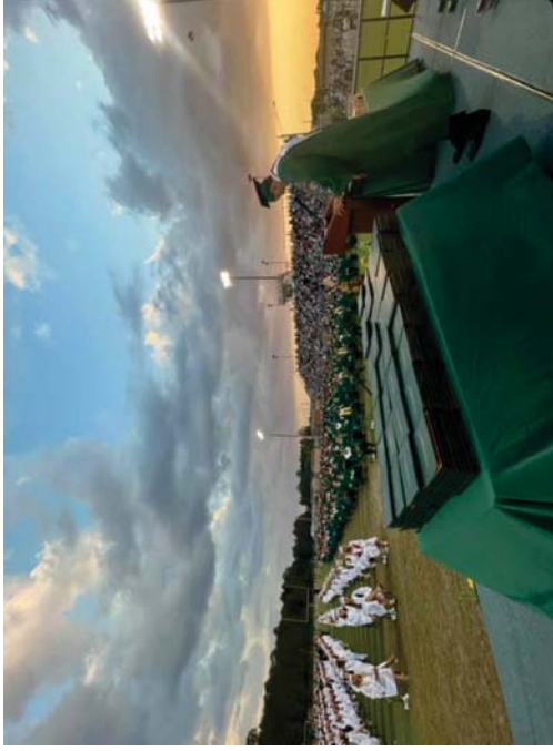
Fleming Island High