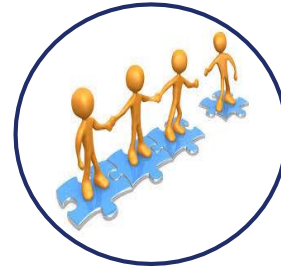
Connecting for Student Success