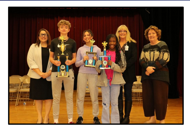
District Spelling Bee