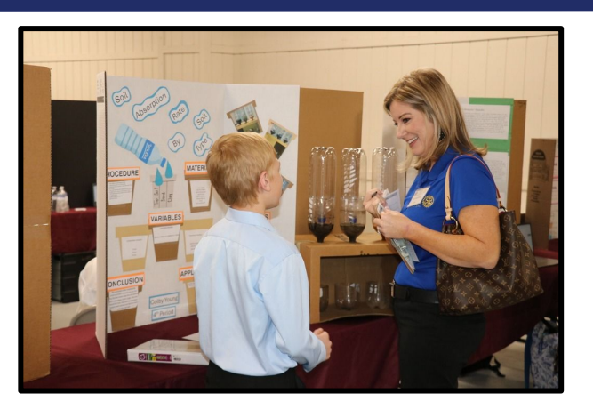
Rotary Science and Engineering Fair