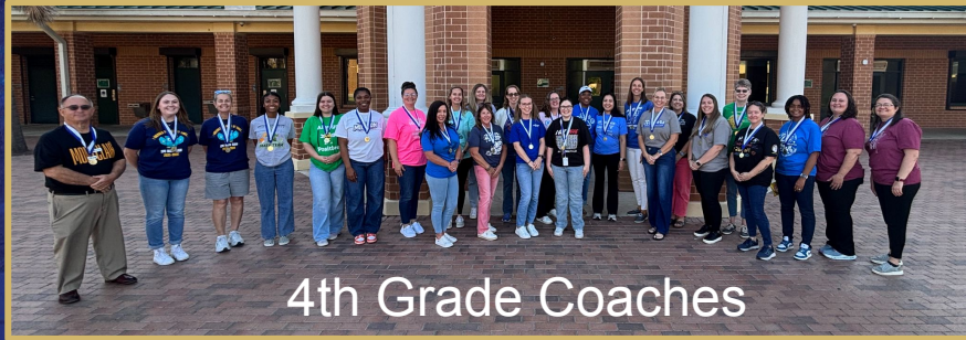
4th Grade Coaches