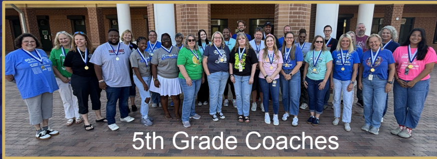
5th Grade Coaches