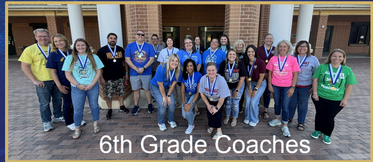
6th Grade Coaches